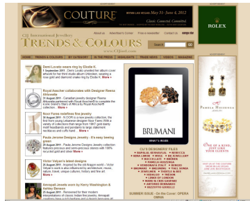
CIJ online on the Web