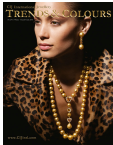
CIJ in print

The best international promotion for your jewellery